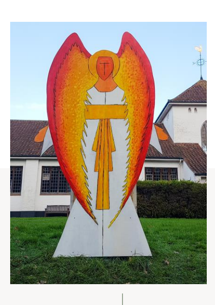
There are angels as big as the universe.