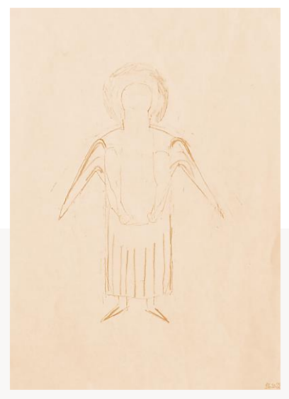
A figure appears in a doorway illuminating a path ahead