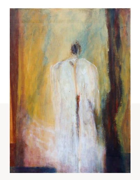
Sometimes in the deeper recesses of myself, there is a presence both deeply familiar and unknown.

Below is art and poetry created for the 2022 Inspiring Angels Festival. A popular theme for our artists, we have introduced the festival into our annual calendar. In partnership with the Parish of Hampden Park and Hydneye, we intend to produce a zine of last year's offerings, in advance of the 2023 festival.