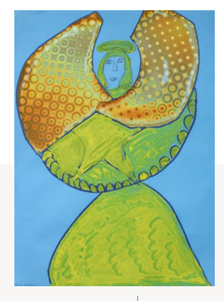
She taught me to reflect.