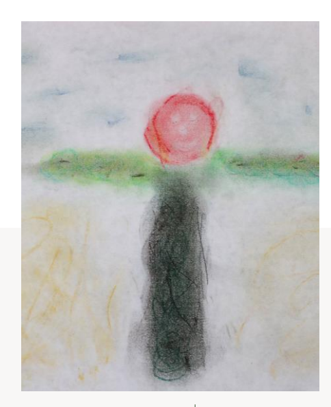
Angels tread softly and are gentle, they are childlike and trusting.

The Artists & Poets who contributed to this page are x3 artistically minded, x3 neurodivergent, x6 trauma related, x1 associated autoimmune condition x2 serious mental illness