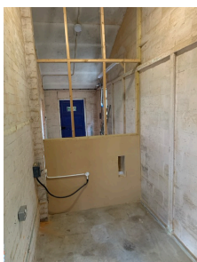
The old store (missing the junk and jumble)